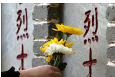
Commemorative activities held in various places to remember the martyrs