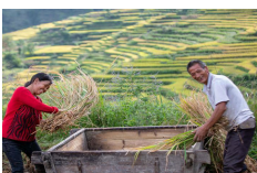
Xiangyang, Chongqing: "Huanda Happy Event" in Huatian Township