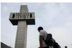
Nanjing sounds air defense warnings to remember "9-18"