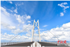
Hong Kong-Zhuhai-Macao Bridge Construction Memorabilia