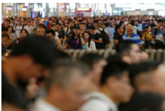
National Day holiday ended the peak of return passengers across the country