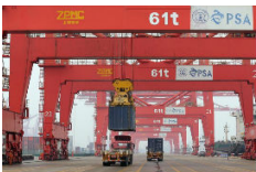
Lianyungang Port completed cargo throughput of 177 million tons in the first three quarters